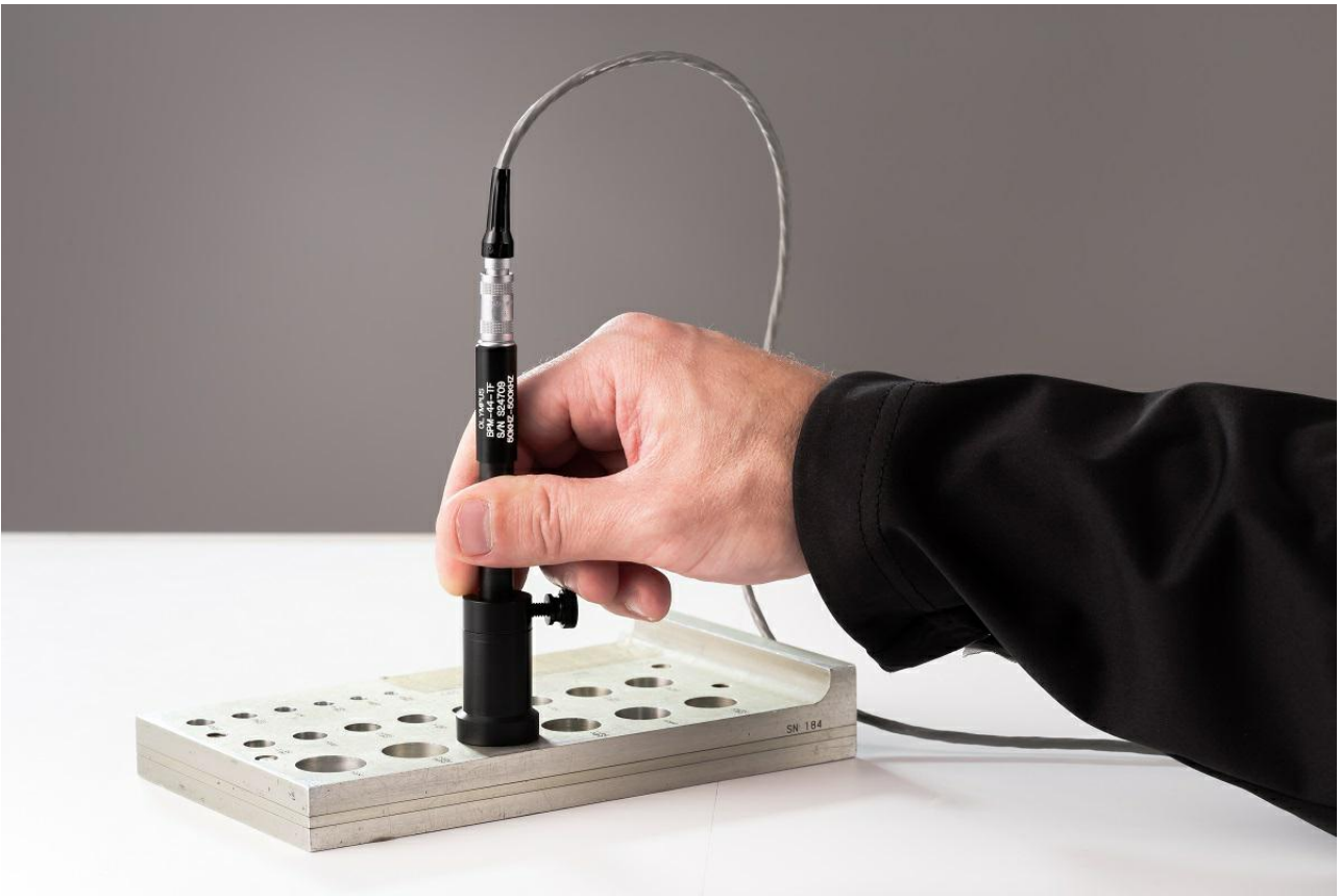
Figure 4. Standard manual probe and cable, showing typical cable bind when testing fastener or bolt holes manually.