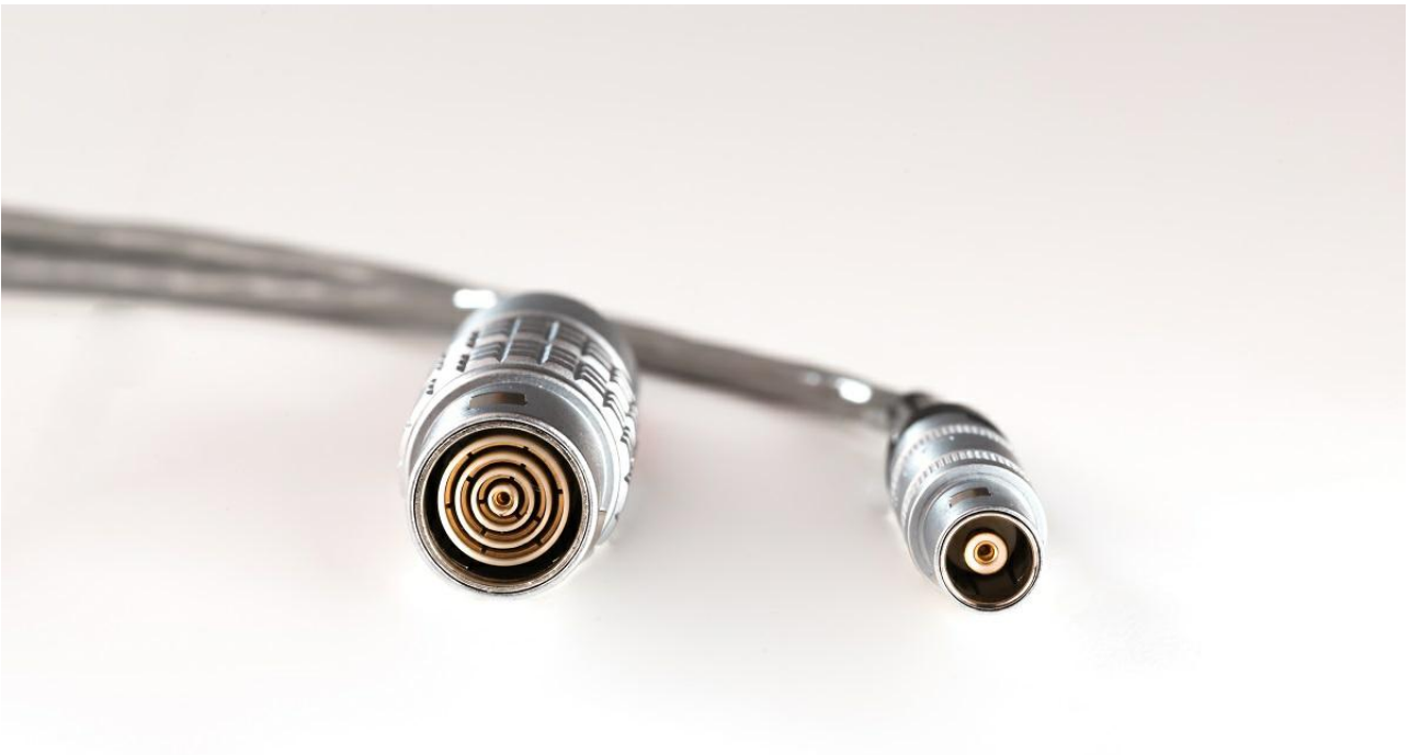
Figure 3. LEMO concentric contact connectors.

The solution requires inspectors to spin only the probe, rather than both the probe and cable assembly. Along with improved ease of use, the cable offers exceptional performance with minimal to no electrical noise.