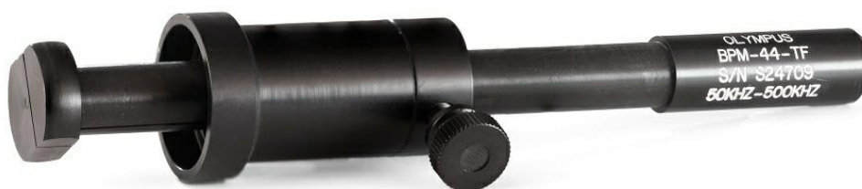
Figure 2. Manual bolthole probe.

Consider the example of an aerospace fastener hole inspection for the detection of interior diameter (ID) cracks in all orientations. When using a typical manual bolthole or threaded probe, the cable must spin alongside the probe for testing to occur. If multiple rotations are required for inspection, this can cause unwanted cable bind. A twisted cable can make the inspection cumbersome and place unneeded stress on the cable, leading to equipment failure.